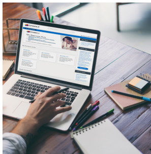
MY BUSINESS HUB